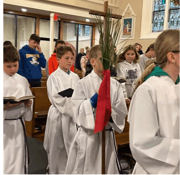
PSR Mass following Palm Sunday.

Your General Fund contribution enables FAITH IN ACTION